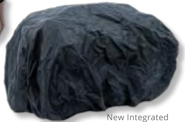
New Integrated Rain Cover