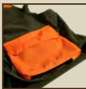
Quick clean-out zipper