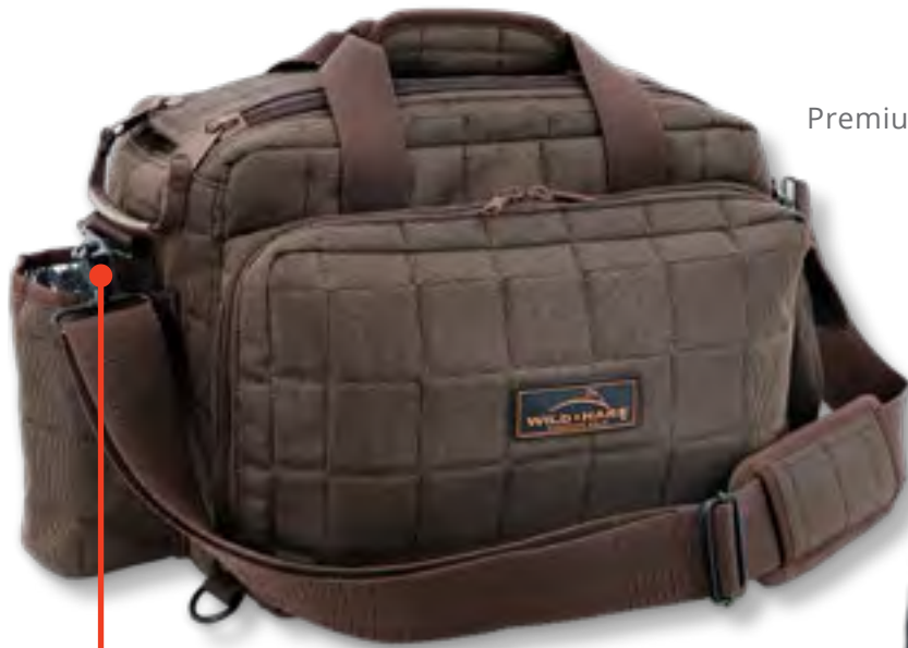
Premium Hedgetweed Brown (HB)