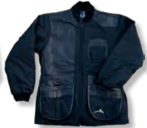
Black w/ Black Leather (BK)