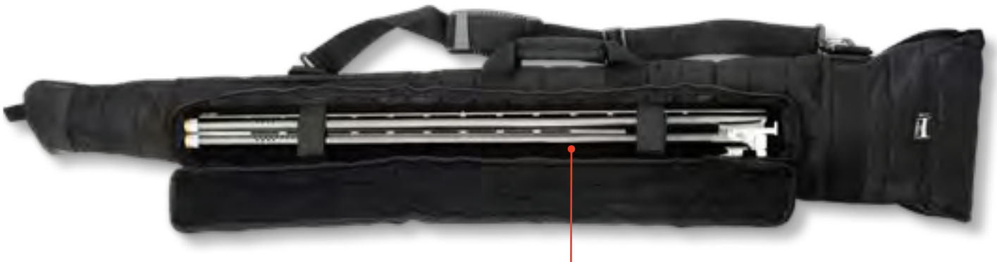
34" pocket for alternate barrel