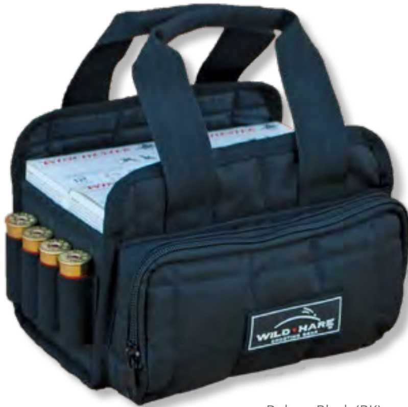
Deluxe Black (BK)