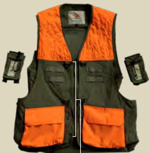
14+” front opening for loading birds