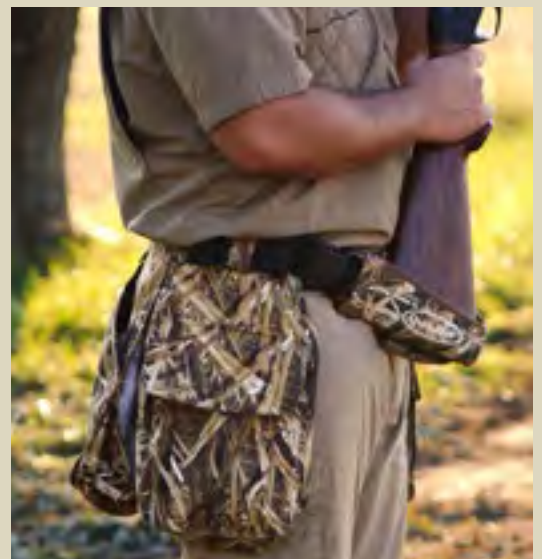
Compatible with the Quick-Shot holster (pages 6-7)