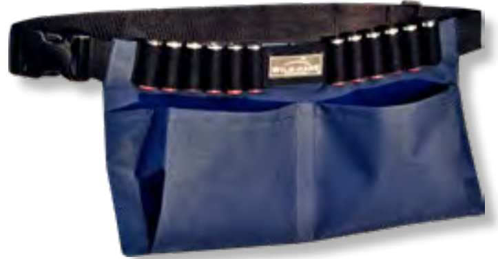
Navy (NV) Black (BK) also available