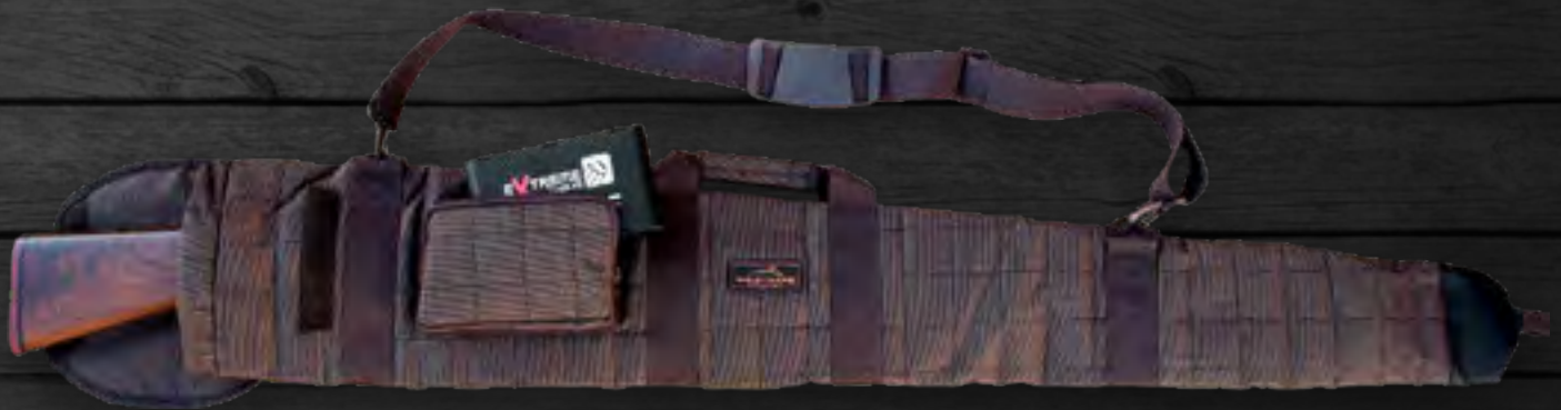
Gunboy | 54 inches