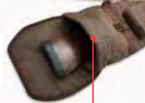
Flex frame opening for easy loading