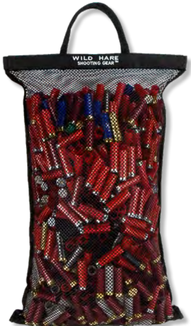
(Model: 1000 Hulls)