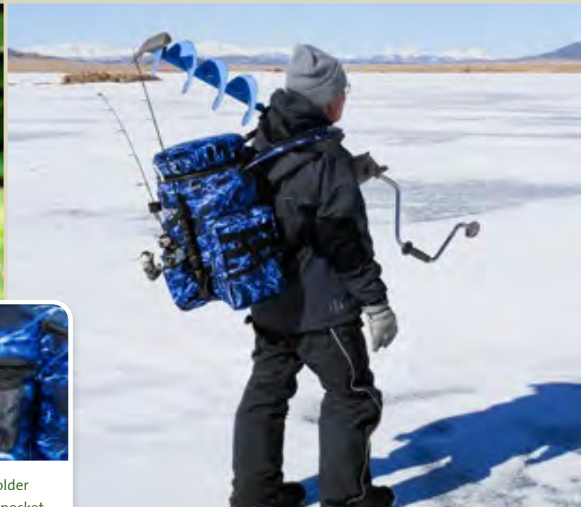
An ideal ice-fishing bucket