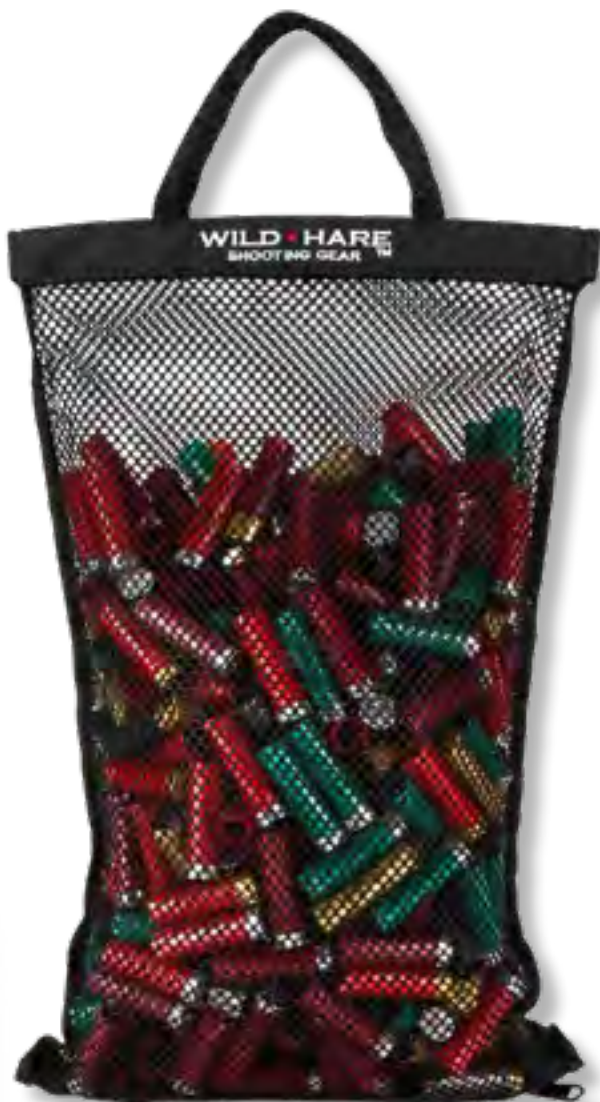
(Model: 400 Hulls)