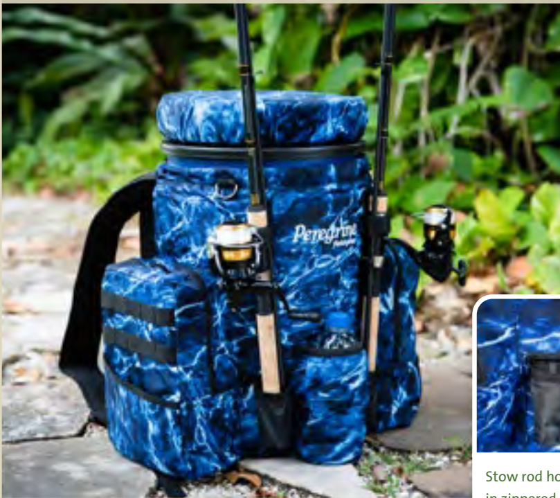
Integrated, adjustable Stow-N-Go rod holders