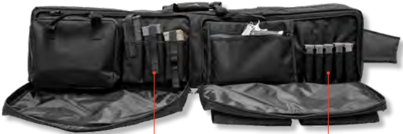
Pouches hold 2 AR-15 magazines each (20-30 rnd)