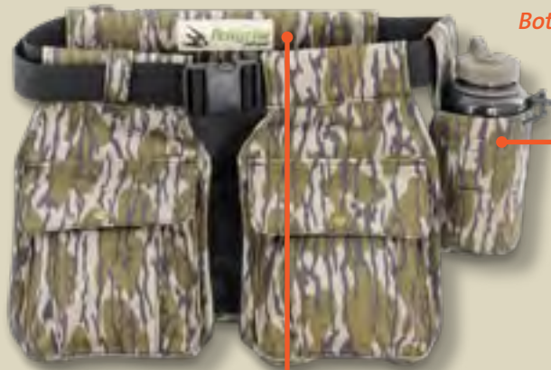
Padded waist band with belt up to 56 inches