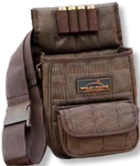
Premium Hedgetweed Brown (HB)