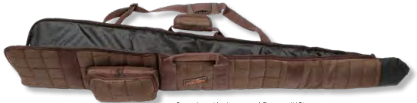
Premium Hedgetweed Brown (HB)