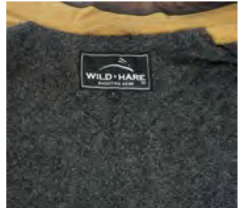
Quilted Fleece Lining