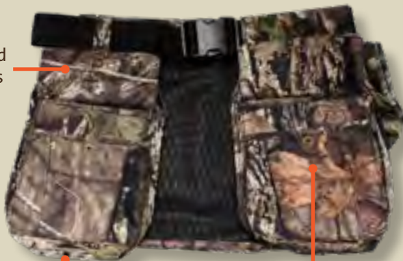
Rain-shield cover flaps