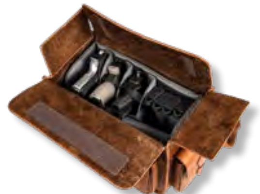
Fits Wild Hare Leather Range Bag (pg. 58)