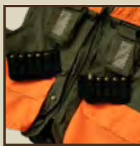
Removable neoprene shell holders (.410-12 ga)