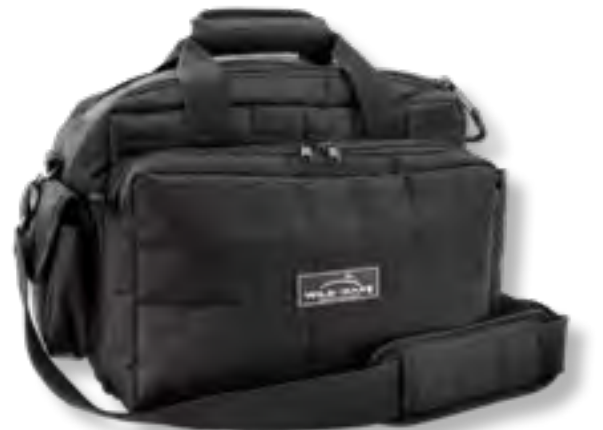
Deluxe Black (BK)