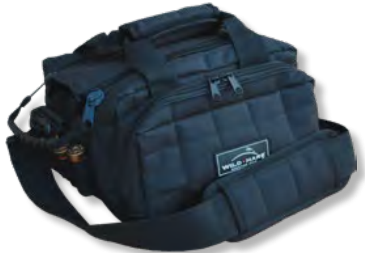
Deluxe Black (BK)