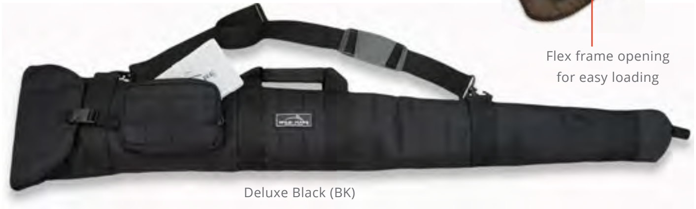
Deluxe Black (BK)