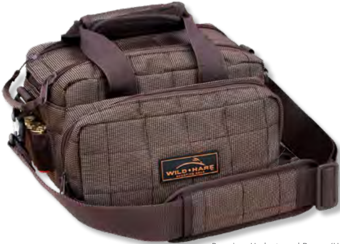
Premium Hedgetweed Brown (HB)