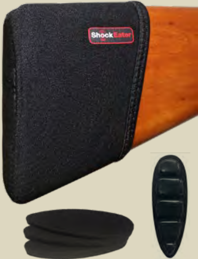
Length of pull adjustment spacers

EAT THE KICK WITH THE SHOCKEATER RECOIL PAD KIT