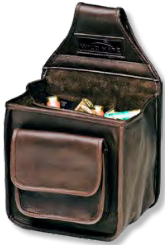
Java (JV) (Dusk not shown)