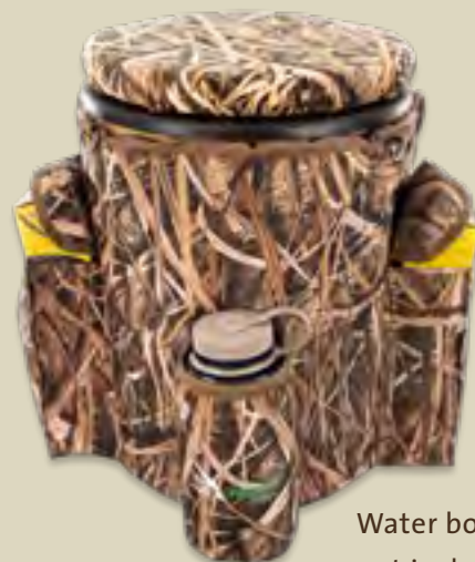
Water bottle not included