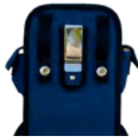
1" metal belt clip and 2 belt loops