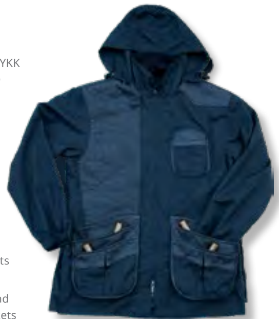
Black w/ Black Leather (BK)