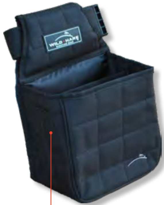
Nylon loop adapter for WH-306S Mesh Hull Bag (page 50)