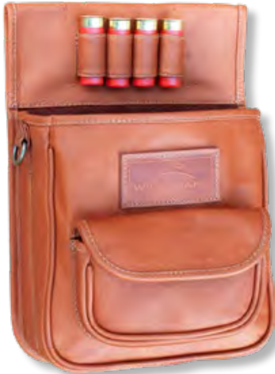
Dusk (DK) (Java not shown)