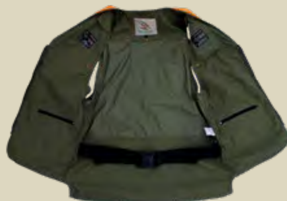
Integrated waist belt