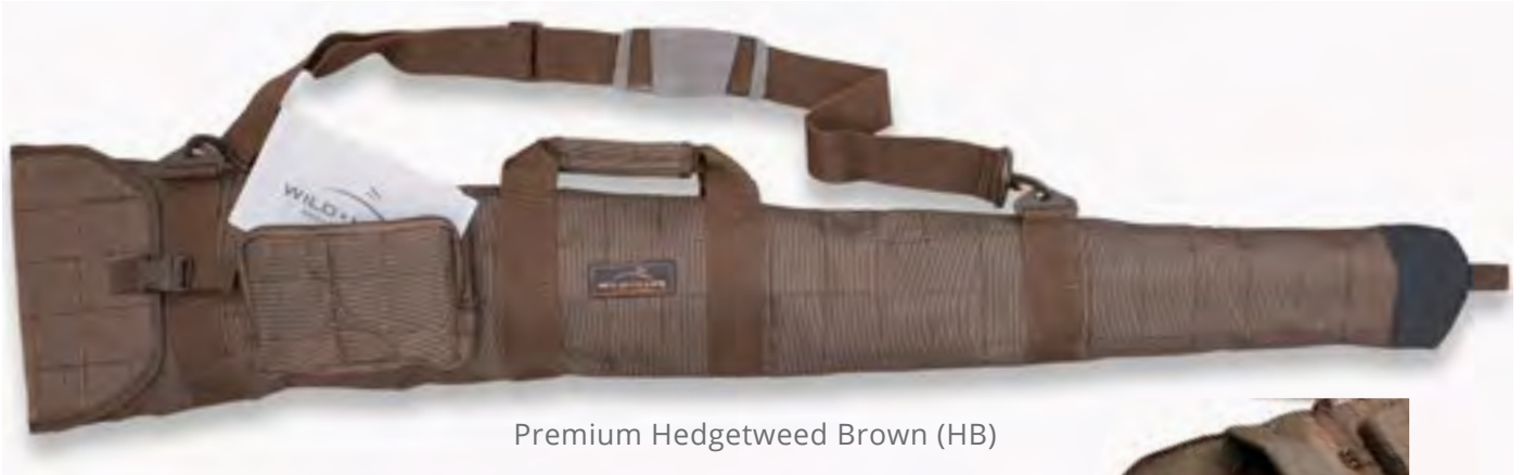
Premium Hedgetweed Brown (HB)