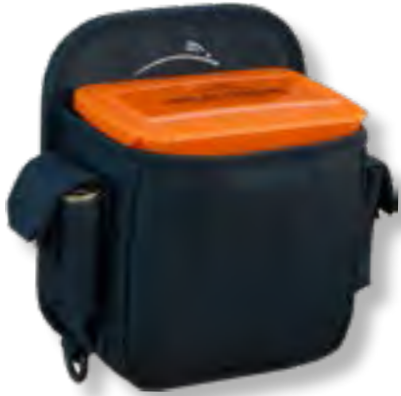
(Mr. Lid not included)