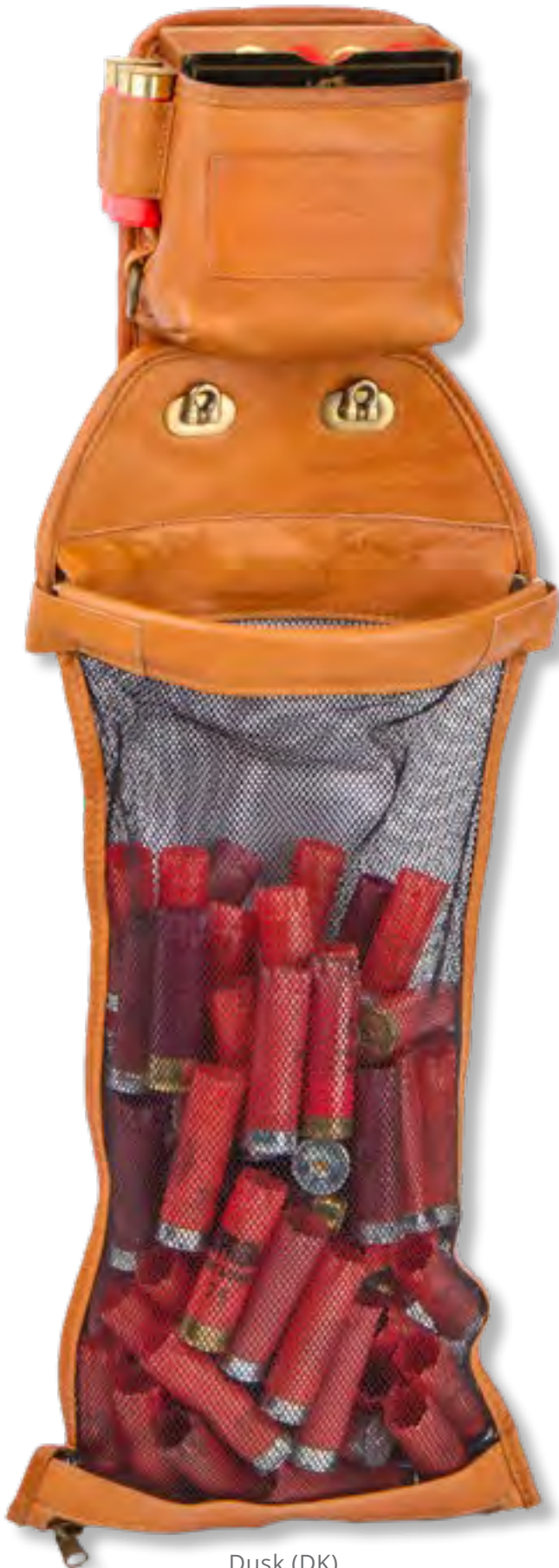
Dusk (DK) (Java not shown)