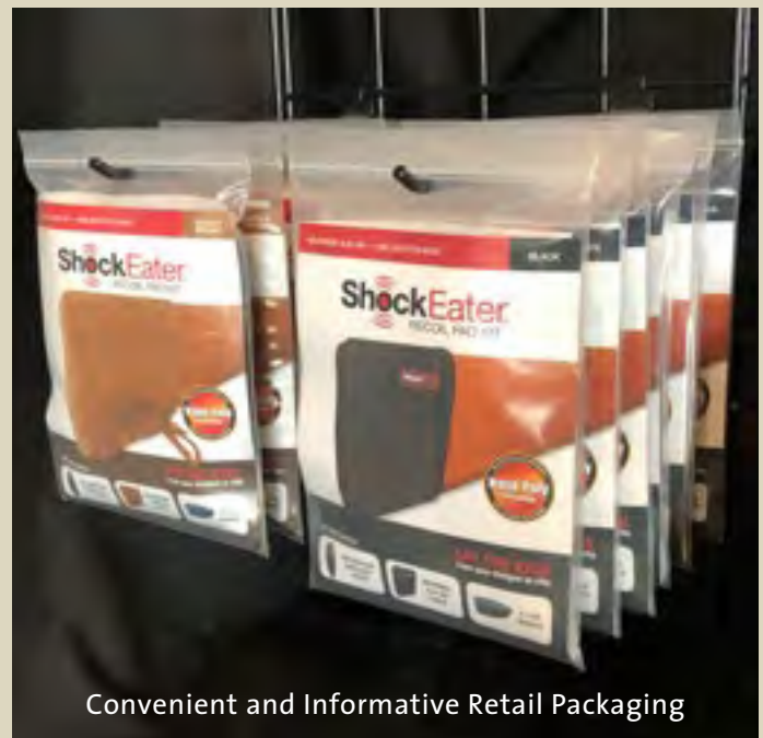
Convenient and Informative Retail Packaging