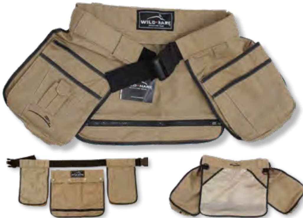
Detachable reloader's pouch