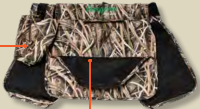
Reinforced drink holder with drawstring