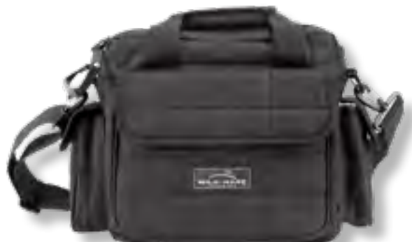
Deluxe Black (BK)