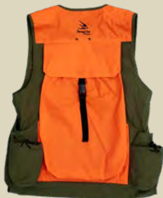
Rucksack for extra carrying capacity