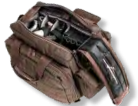
Fits Wild Hare Tournament Bag (pg. 50)