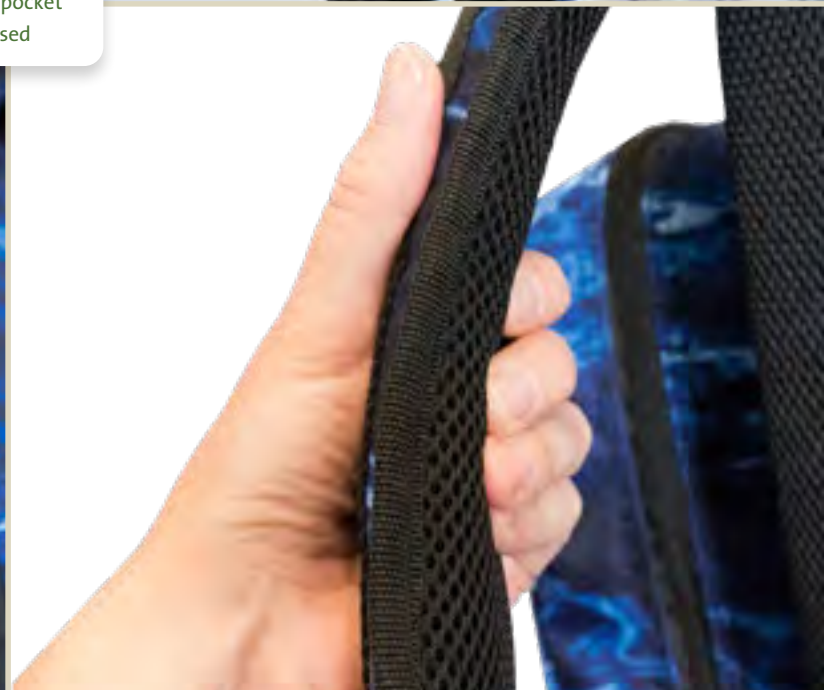
Extra-thick shoulder straps