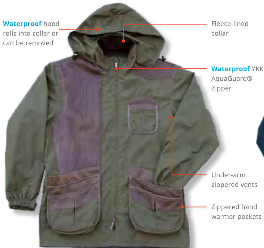
Olive w/ Distressed Brown Leather (OV)