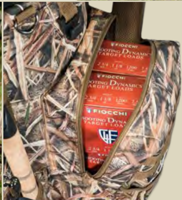
Holds 4-6 boxes of shells or 2 tackle boxes per pocket