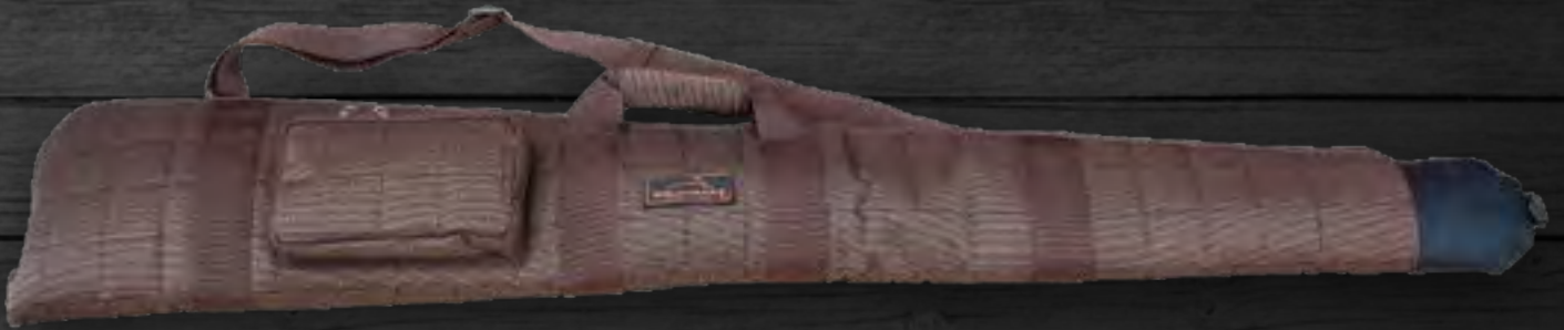
Zippered Gun Case | 52 inches

3.0 mm plastic reinforced base insert (on bags) for durability