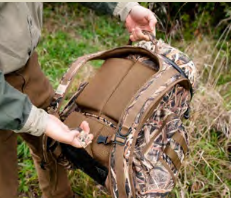
Padded dumping handle