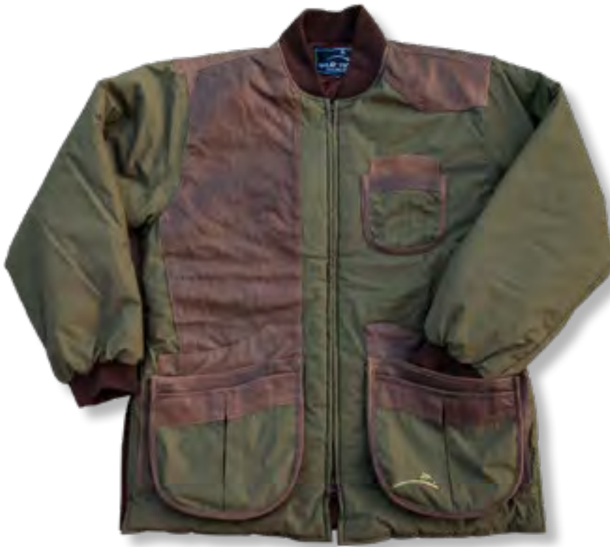
Olive w/ Distressed Brown Leather (OV)