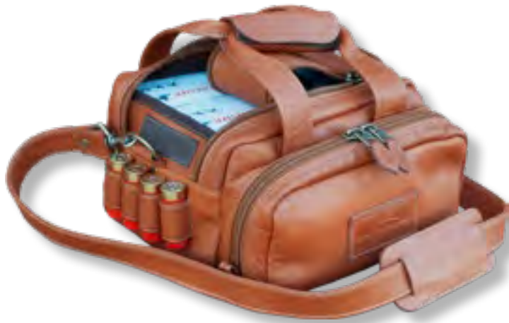
Dusk (DK) (Java not shown)