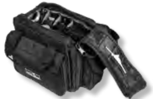
Fits Wild Hare Sporting Clays Bag (pg. 51)