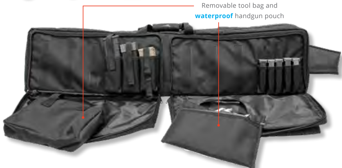
Removable tool bag and waterproof handgun pouch