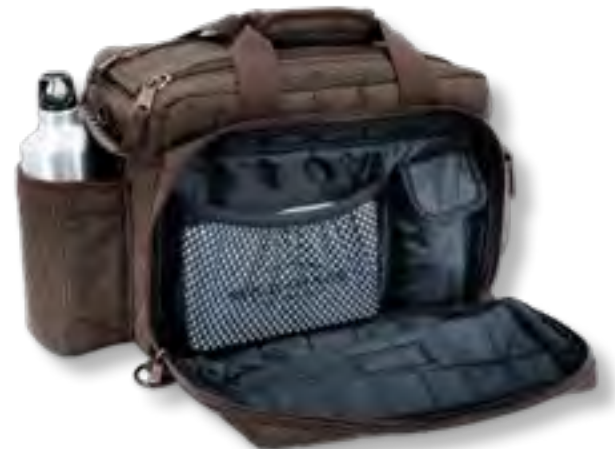
Redesigned Organizer Pocket