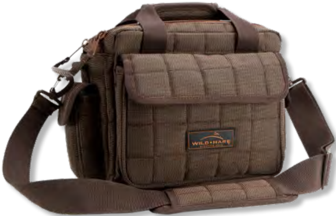
Premium Hedgetweed Brown (HB)