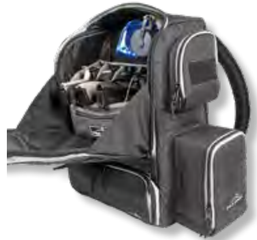
Convert Competition Range Backpack into a Pistol Range Backpack